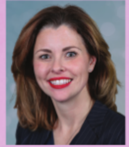
Councilwoman Erin King Sweeney